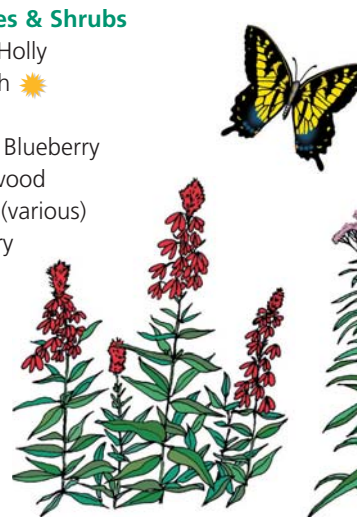
Cardinal Flower Lobelia cardinalis