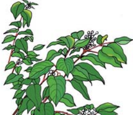
Red-osier Dogwood Cornus sericea [stolonifera]