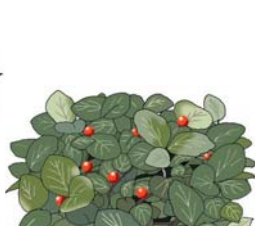
Winterberry Ilex verticillata