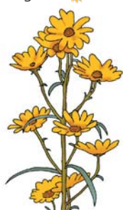
Swamp Sunflower Helianthus angustifolius