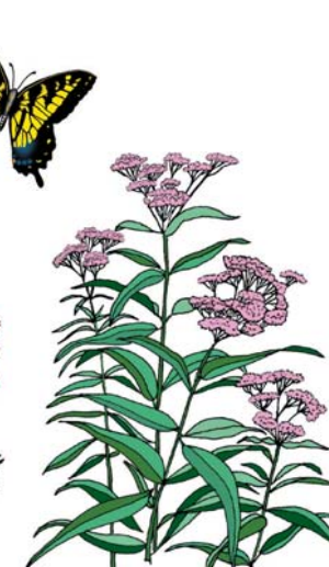
Joe-pye Weed Eupatorium fistulosum