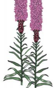
Gayfeather or Blazing Star Liatris spicata