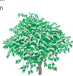
Viburnum Various Species