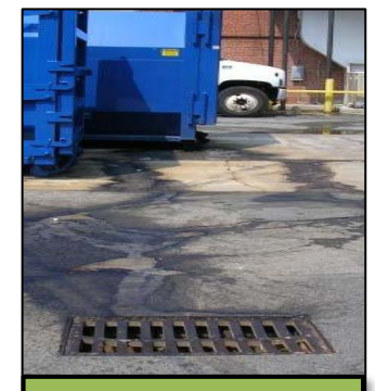
Leaking Dumpster Attracts rats, leaks bacteria & grease into storm drains