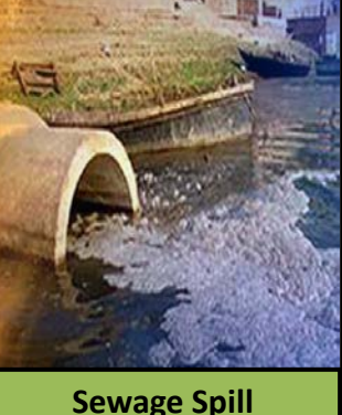
May be Manhole Leak Threat to health & recreation

Construction Site Silt Fence Failure Sediment Kills Aquatic life